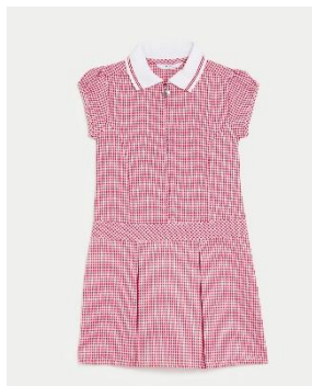
Marks and Spencer